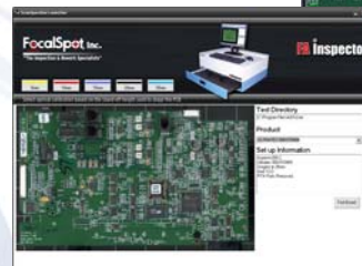
AOI Mode Screens