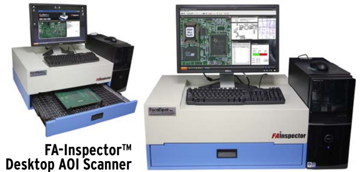
FA-Inspector™ Desktop AOI Scanner

Built-in utilities for fast easy XY, CAD and BOM validation, comparison and correction.